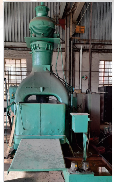
650 x 2200 Surface Grinder