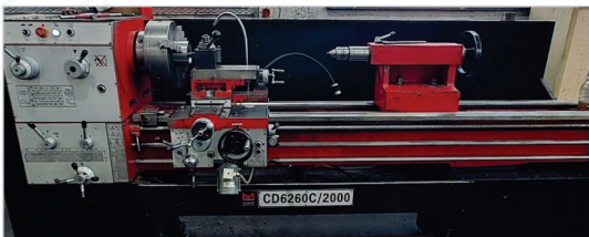
2m Horizontal Lathe