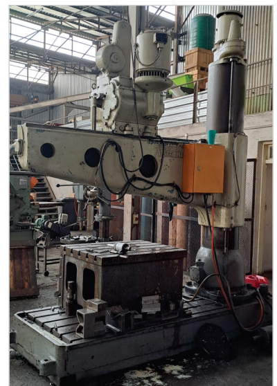
2.5m Radial Arm Drill