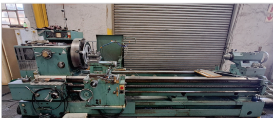
3m Horizontal Lathe