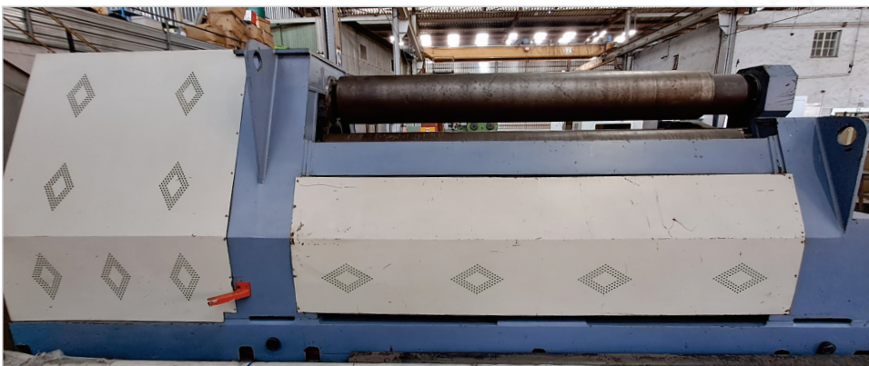
3m x 25mm Plate Roll