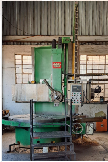
2.3m x 1.7m Vertical Lathe