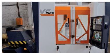
1120 x 520 3-Axis VCP 106 Vertical Machine Centre