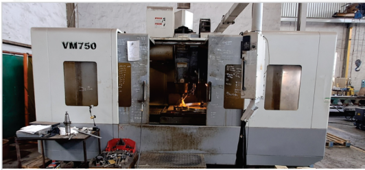
1800 x 900 4-Axis VM 750 Vertical Machine Centre